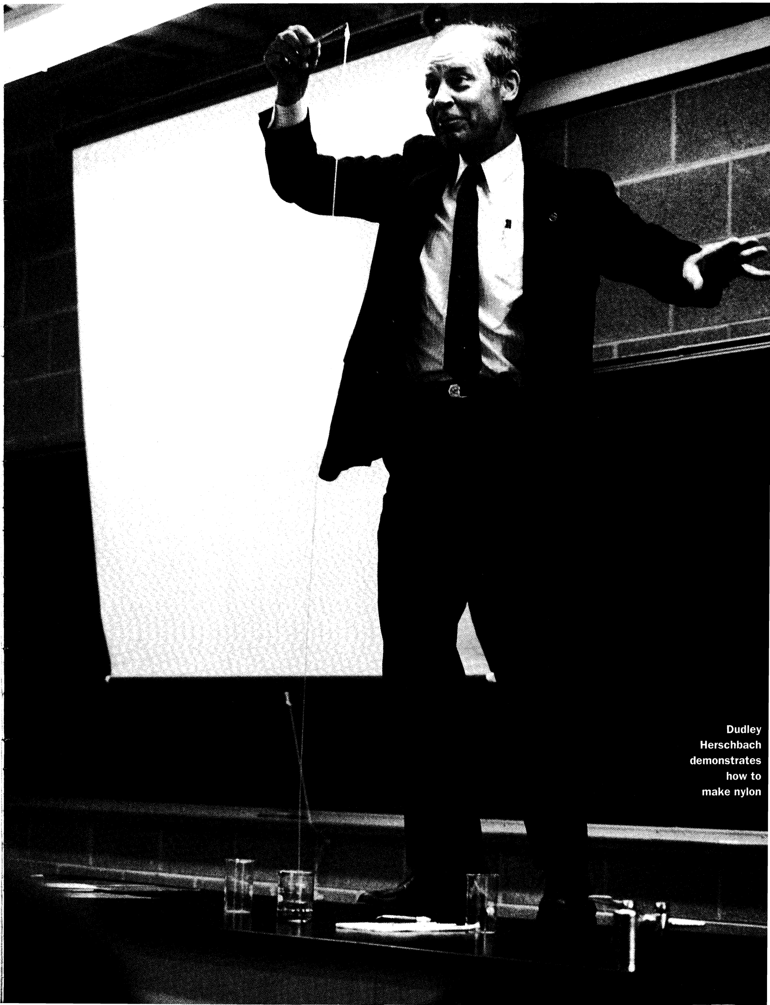
Dudley Herschbach demonstrates how to make nylon