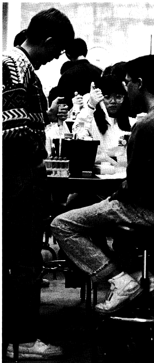
Students working in Harvard University Science Center laboratories

tines do not automatically produce happy results. Exercises overdone or poorly done often induce dullness or bad habits. The usual textbook problems should bear a warning label: Too much exposure to this stuff is dangerous to your mental health! Typically, the danger is manifested in three ways: